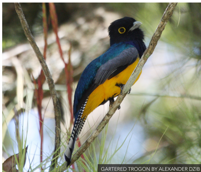
GARTERED TROGON

Please join our Facebook page and share photos of your program. Visit us at www.facebook.com/holbrooktravel . We hope to hear from you.