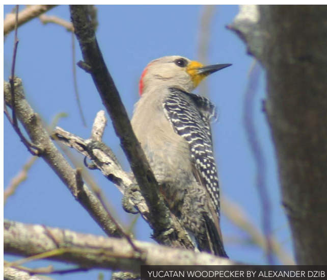
YUCATAN WOODPECKER BY ALEXANDER DZIB