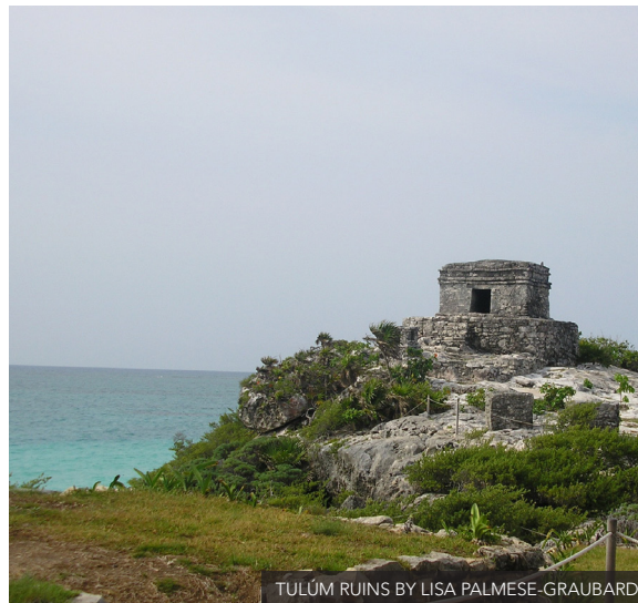
TULÚM RUINS BY LISA PALMESE-GRAUBARD

The ramón tree can grow to more than 120 feet and provides habitat for a wide array of rainforest residents, making this an exceptional ecological and archaeological visit. Continue to Tulúm, a beautiful 700-year-old Maya walled city, stopping en route for lunch and a boat ride at Bacalar Lagoon. Also known as the "Lake of Seven Colors" because of its different shades of blue, Bacalar Lagoon is one of Mexico's hidden treasures. At the end of the day, arrive in Tulúm and check in at the hotel. Overnight at Hotel Los Lirios. (BLD)