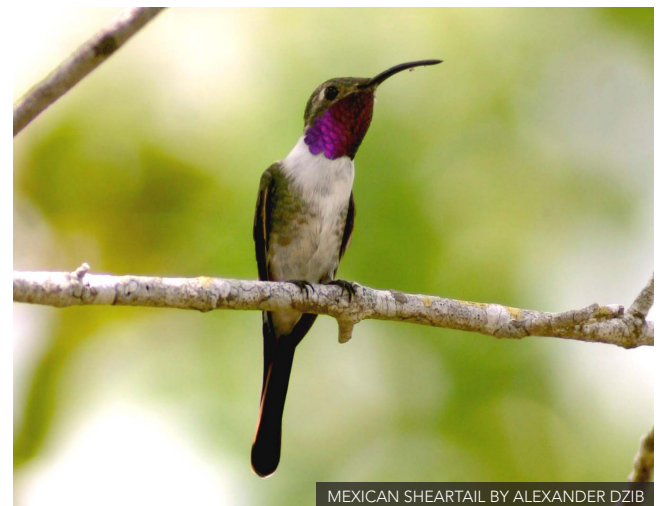
MEXICAN SHEARTAIL BY ALEXANDER DZIB

Early morning birding. After breakfast, visit the Chichén Itzá ruins with a site lecture. The forests in and around the impressive archaeological complex are home to a variety of wildlife. Target species include the Yucatan Jay, Rose-throated Becard, Masked Tityra, Black-crowned Tityra, Golden-fronted Woodpecker, Boat-billed Flycatcher, Cave Swallow, Scrub Euphonia, Yellow-throated Euphonia, and Social Flycatcher; endemic bird species include the Yucatan Woodpecker