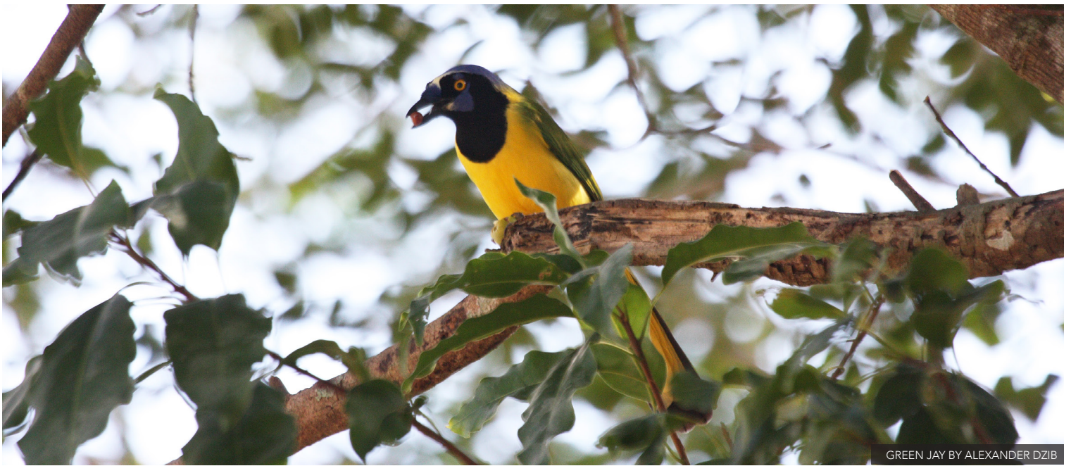
GREEN JAY