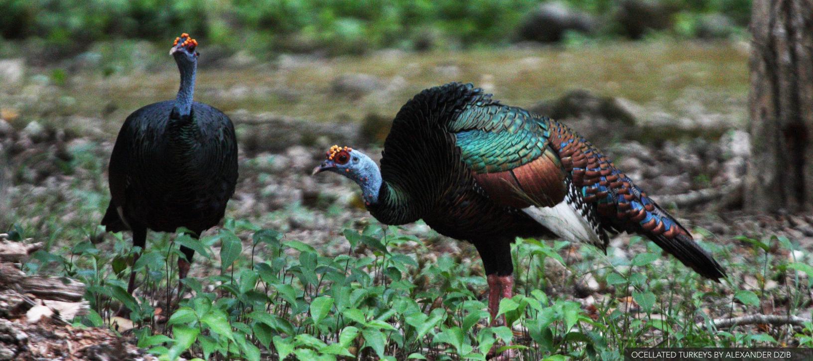
OCELLATED TURKEYS BY ALEXANDER DZIB