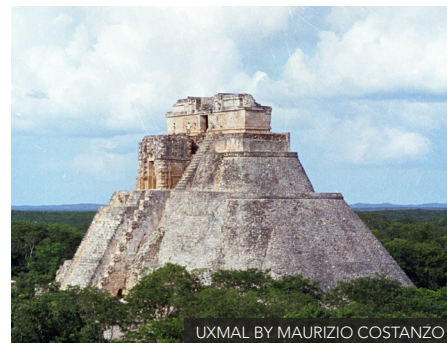
UXMAL BY MAURIZIO COSTANZO